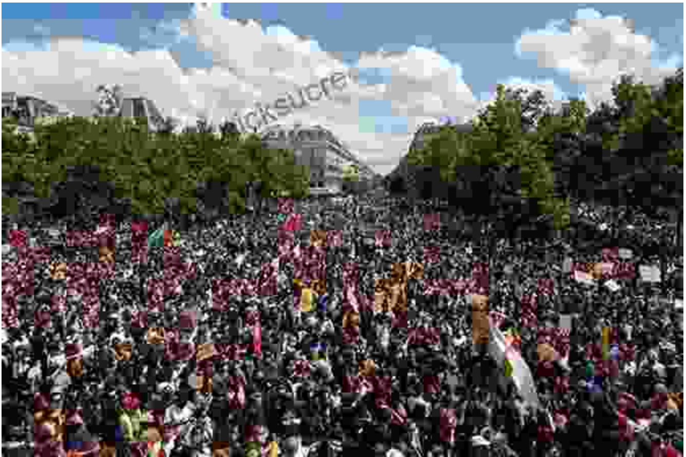
A scene from the Algerian War

While Ernaux's narrative is deeply personal, it also serves as a mirror to the broader social and historical forces that have shaped her life and the lives of her contemporaries. Through her own experiences, she provides a glimpse into the changing social landscape of France in the second half of the 20th century. The Days becomes a collective memoir, a testament to the shared experiences and struggles of a generation that lived through momentous events, from the Algerian War to the rise of feminism and the digital revolution.