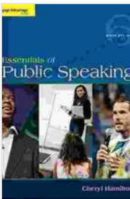
Image Alt Text: A person standing at a podium delivering a speech to an audience.

Cengage Advantage Series Essentials of Public Speaking is a comprehensive resource that can help you develop the skills you need to speak confidently and persuasively. If you are looking to improve your public speaking skills, this book is a great place to start.