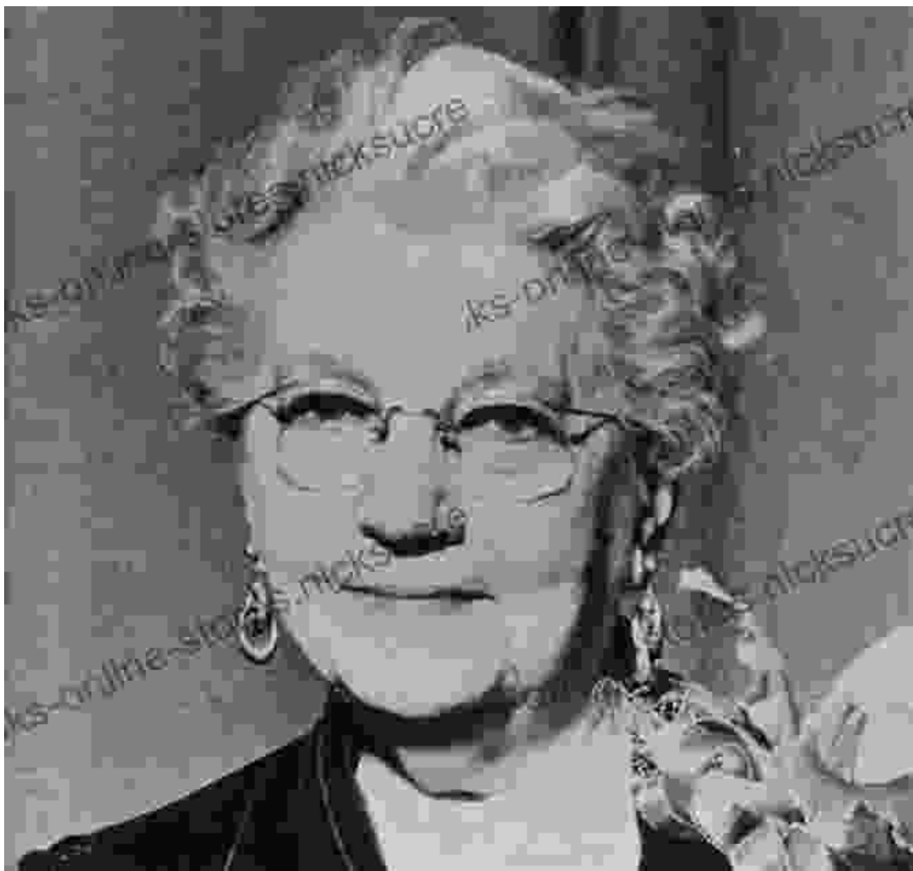
Laura Ingalls Wilder in her later years, reflecting on her extraordinary life.

Wilder's writing not only tells the story of her own life but also paints a vivid picture of the American frontier experience. Her stories have inspired countless readers, young and old, to appreciate the challenges and triumphs of pioneer life, the importance of family, and the enduring power of the human spirit.